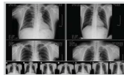
Multi exam display